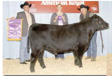
Bonanza's Prince 2Y

Black Broken Arrow Nero Ardrossan Delvene EZ Railway 05N EZ Tinkerbell 27L Commander K162 Perfection F183 Navigator N323 Geraldine III P094