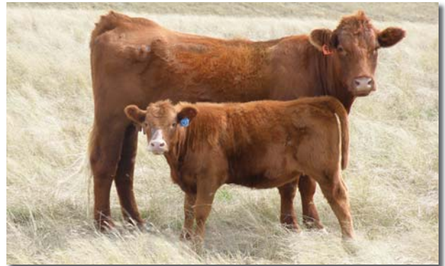
Lot 45 as a calf with her heavy milking mother