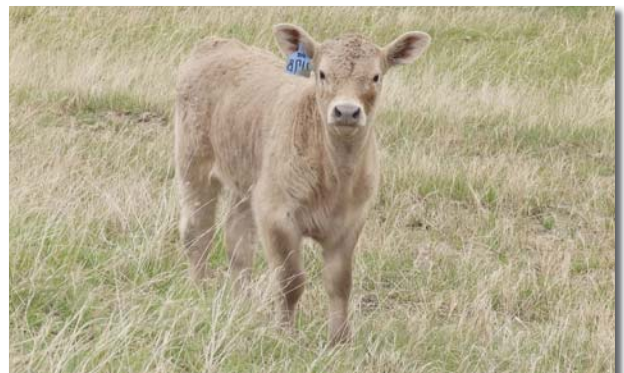
Lot 31A, a fancy Boxcar heifer