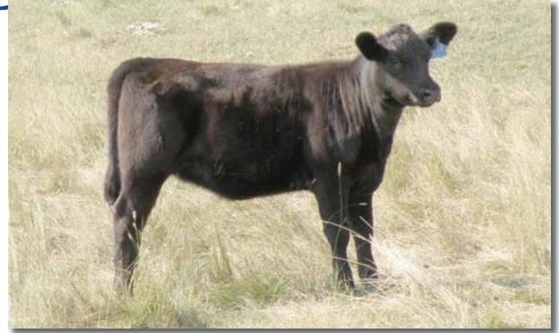
Lot 55 as a calf

Talulah has a super pedigree that traces to some of our best females. Titan's dam, Lady Luck, and the 149P cow have never missed, always coming in with the top calves in the herd. No gamble in picking up this fine heifer for your replacement pen. She's been a standout since she was a baby on her dam's side!