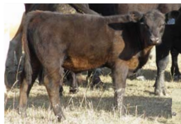
Lot 67, as a calf

Black Jack has that added dimension that you find in these good 3/4 blood bulls. He's beefy and good haired. His little sister sells as Lot 55. His dam is a double half and a terrific cow that will give him Lowline genetics in the fourth generation on both sides of his pedigree. He should breed true.