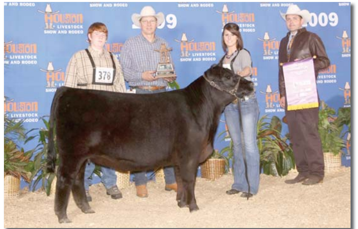
Lot 2, 2009 Houston Grand Champion

Lot A: 3 fullblood Lacey embryos by EZ Captain Jack 1X FM10440.