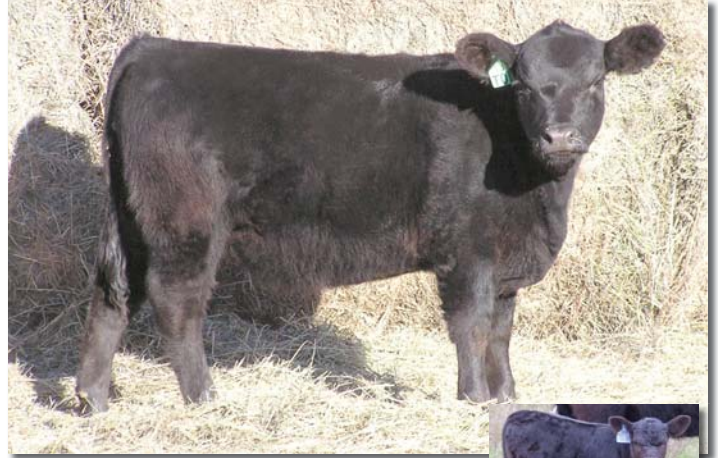
Lot 10, as a calf and Lot 10A (inset)

Here's Tootsie, a great Lisbon daughter out of the No. 1 dollar-generating cow ever in our herd. She has a son in the Alturas Ranches herd in California. She is a superbly well-balanced and well-muscled young cow that would never be ordinarily offered for sale. She has a purebred herd sire prospect at her side by EZ Buster that is going to be a powerful individual that should breed true and bring all of the best Lowline traits to his offspring with a little added growth. He is big topped and has loads of muscling in his hind quarter and a very stylish look.