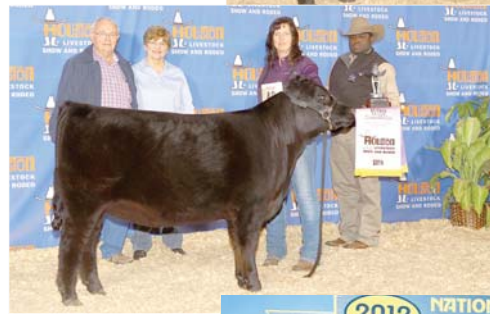
JH Fancy Lady 4A, 2014 Houston Reserve Champion, son of EZ Cinderella 61U, full sister to Lot 7.