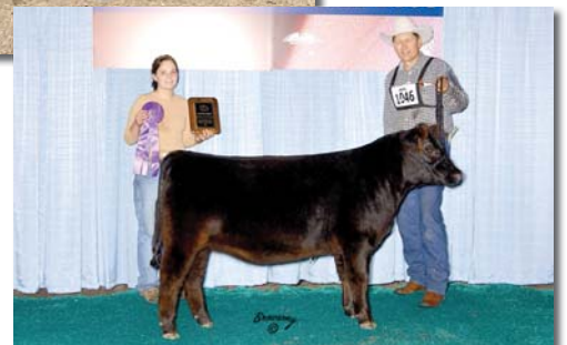
Lot 3, American Royal Grand Champion