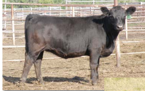
Lot 4, as a yearling heifer

Marnie was your 2009 Reserve Grand Champion Female at the Iowa State Fair. This black, red-gene carrier brings some fantastic outcross genetics on the bottom side of her pedigree. She sells with a fantastic, stylish red bull calf by SC Gus. This Redwood 13B herdsire prospect is futuristic and has unlimited potential to sire some of the very best red cattle in the breed. Semen interests in this red rascal could be phenomenal. Effertz EZ Ranch is retaining a one-half semen interest in this bull calf.