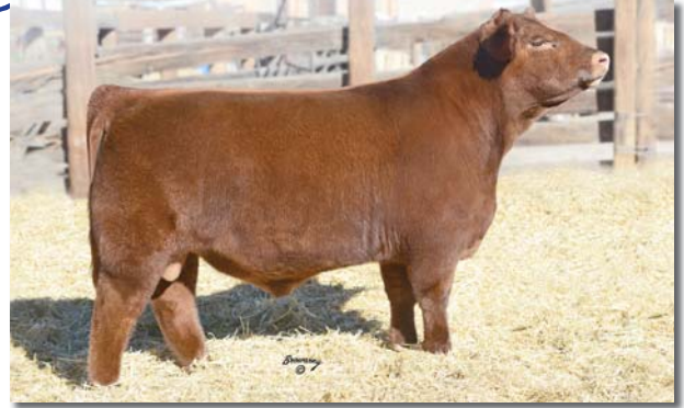
Foxfire, Houston Champion % Bull. As a special feature, breeding privileges to Foxfire are offered on any of the five females on this page.