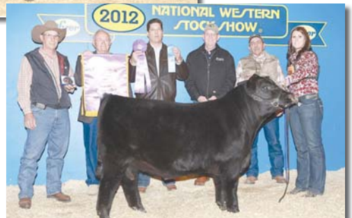
Prince Charming, 2012 National Champion Bull, son of EZ Cinderella 61U, full sister to Lot 7.