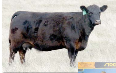
Lot 1 as a 6 year old

Maggie was the popular 2006 National Champion Female and a great producing daughter of one of the breed's strongest maternal lines, EZ Magnum 72J. Her udder quality and powerful yet smooth muscling make her a donor cow that will not only produce show winners but prepotent beef producers as well. She has already produced three herd bulls for prestigious Lowline herds and has averaged over $8,000 on every calf she has produced. She's a great granddaughter of the Perfection H002 cow who has produced so many winners and outstanding donor cows over the years. She produced 9 good grade 1 embryos in her last flush.