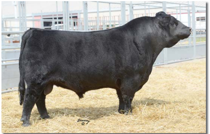
Demolition, our exciting new red gene carrier fullblood bull sired by Gus.