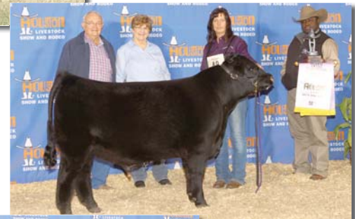
JH Mr. Jack 5A, 2014 Houston Reserve Champion, son of EZ Cinderella 61U, full sister to Lot 7.