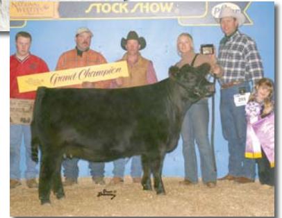
Lot 1, 2006 National Champion Female