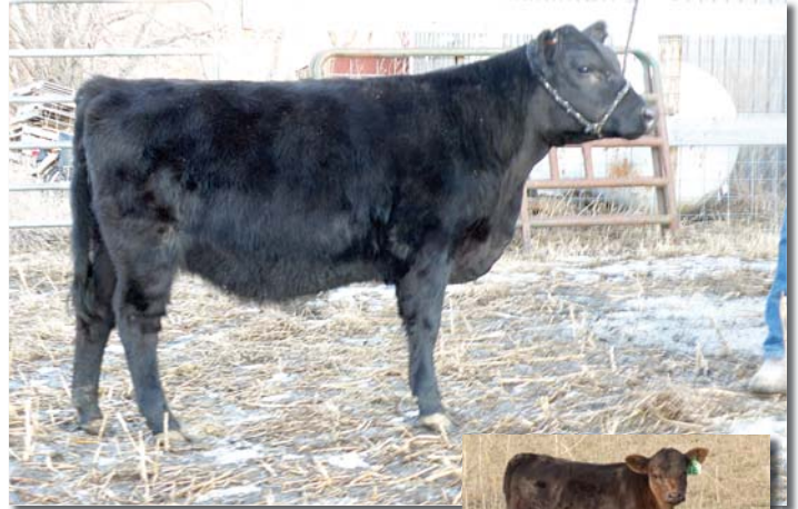
Lot 17 as a yearling and Lot 17A

Here's a beautiful young Spring Creek Tonka cow, Bonanza's Quadrille, whose dam is an own daughter of Colombo Park Xerxes, the well-known son of the great Colombo Park Tannhauser. She has a very attractive daughter of Boxcar at her side with a world of style and eye appeal to go along with her very unique outcross pedigree. This young cow is putting it all into her calf.