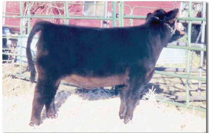
EZ Olivia 15G, dam of Lots 11 & 12