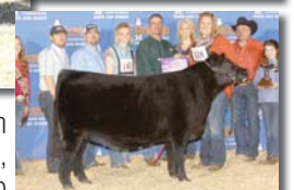
2014 Houston Fullblood Champions, both sired by Jackaroo