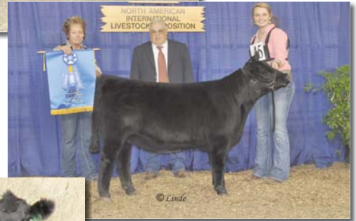
EZ Cinderella 61U, full sister to lot 7