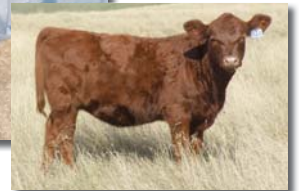
EZ Lucille 112A, Legend daughter