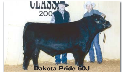
Dakota Pride 60J