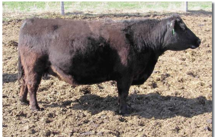
Brambletye St. Louise S208, dam of lot 19

EZ Shelly is a very special replacement heifer. She has wonderful potential to make a great brood cow with her exciting pedigree. She should have an awesome Boxcar calf and, with this pedigree, the calf should have incredible value as a breeding animal whether it's a bull or heifer calf!