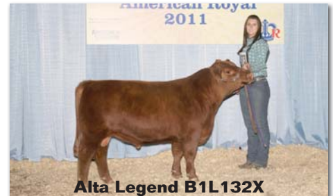
Alta Legend B1L132X