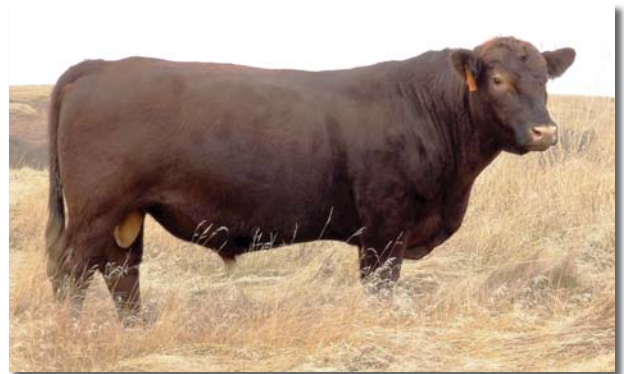
Baron's Red Lad 01Y service sire to Lots 29 and 30