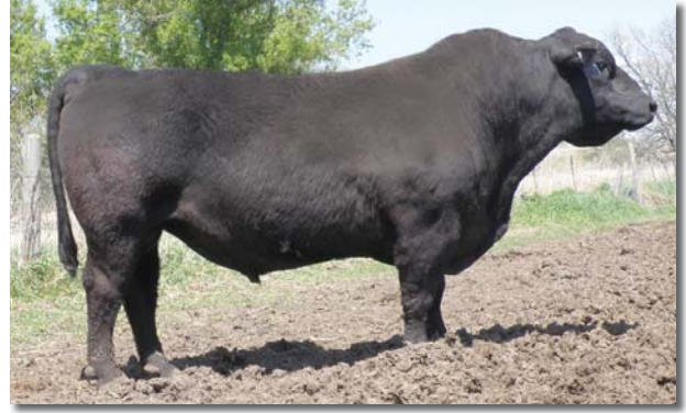
EZ Sawyer 321S

Trangie J078 Binowee Ruth Bosun L006 BR September L503