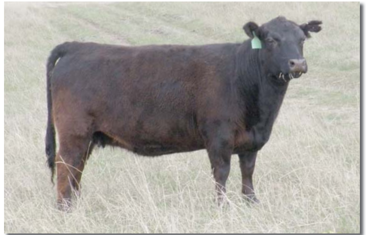
ALM Tayla 38J, dam of lot 14, as a very productive 11-year-old cow