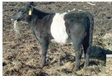
Lot 59, left side

This Jackie heifer is a pretty special purebred heifer calf that has kept up with the 3/4 bloods in her growth curve but shows more typical Lowline body capacity and muscle. She's a dandy that has some very good breeding in her pedigree.