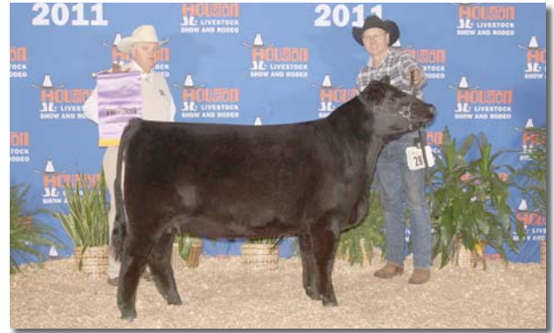
EZ Sultress 335W 2011 Houston Grand Champion % Female and a full sister to Lot 33