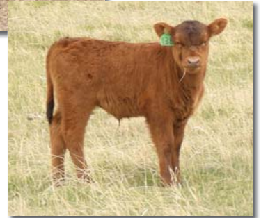
EZ Redwood 13B, Lot 4A