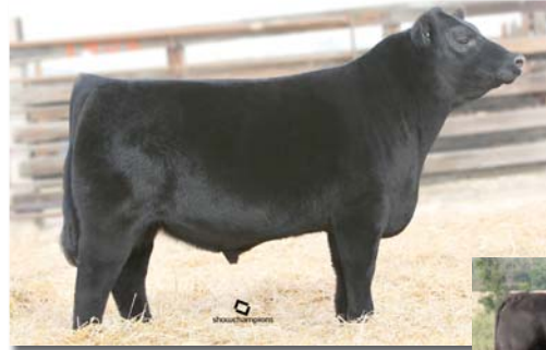
Bonanza's Boxcar 3Y

Black Broken Arrow Nero Ardrossan Delvene EZ Railway 05N EZ Tinkerbell 27L Kobblevale Montague W019 Binnowee Crystal Q068 Binnowee Caesar M455 Trangie L115