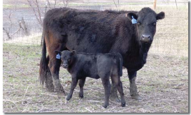
Lot 27 and her Legend heifer calf