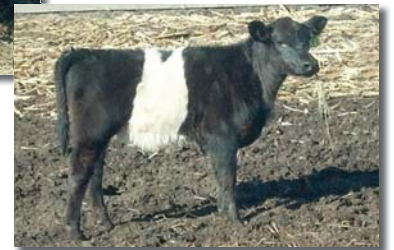
Lot 59, right side

This Jackie heifer is a pretty special purebred heifer calf that has kept up with the 3/4 bloods in her growth curve but shows more typical Lowline body capacity and muscle. She's a dandy that has some very good breeding in her pedigree.