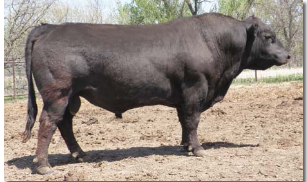
EZ Buster 303U

Eliza Park Brenton N001 Bar J Tina 8H3 BR Bosun L006 BR September L503