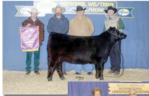
EZ Fantasia 20J, 2001 National Champion and the dam of lots 7, 8 and 9