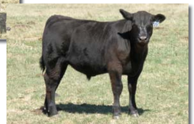
Lot 69, as a calf