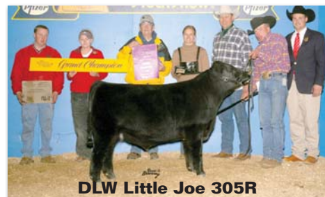
DLW Little Joe 305R