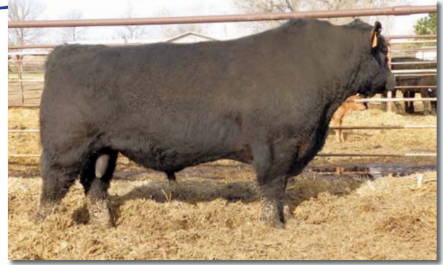
EZ Sundance 010Y, our new halfblood herdsire by Utah, his service sells.