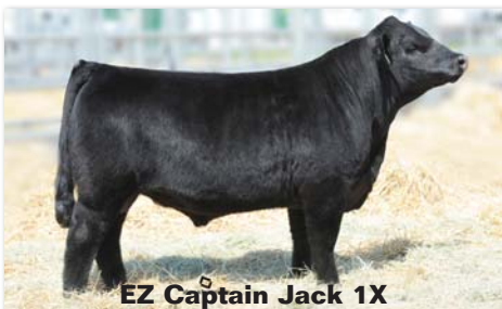
EZ Captain Jack 1X