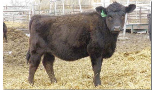
Lot 24, as a yearling

EZ Sparkle 35W in a very top-producing Sultan daughter out of a heifer that we showed to several championships back in 1999. She was very attractive, her daughter is attractive, and the calves out of Sparkle have been very attractive as witnessed by her bull selling as Lot 60. As you can see by her photo as a yearling heifer, she is a dandy. She is bred to Jackaroo.