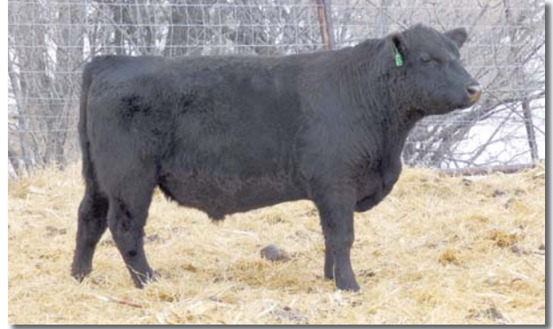
EZ Yukon Jack 3Z

Yukon Jack 3Z is a very top-notch herd sire prospect by the Lowline Sire of Champions, Jackaroo. His dam was a very fancy heifer calf that grew into a top-producing cow who sells as Lot 24. Yukon's maternal grand sire, Sultan, is out of the Bar J Nadine 9J32 3N57 cow, National Champion in 2005. This bull will breed true and should sire some truly great Lowlines – percent age or fullblood!