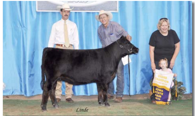
EZ Maggie Mae 19W, dam of Lot 62

Progress is a real top Update son whose dam, Maggie Mae 19W, was Grand Champion in Iowa and Houston and is now in the Cold Spring Farm herd in Massachusetts. She is a 3/4 sister to the Lot 1 Maggie cow. He has the potential to become a leading herd sire of powerful bulls and awesome females.